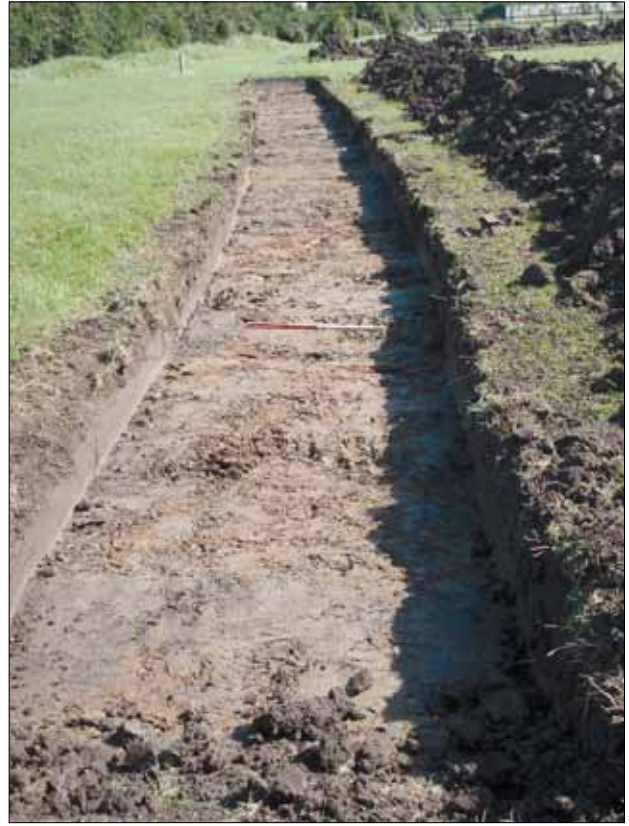
Plate 2: Trench 2, looking north-east