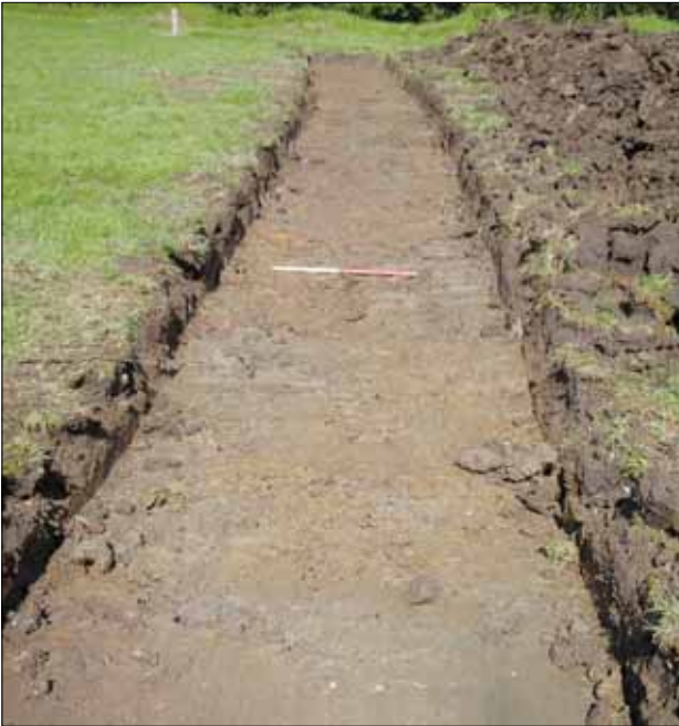
Plate 3: Trench 3, looking north-west