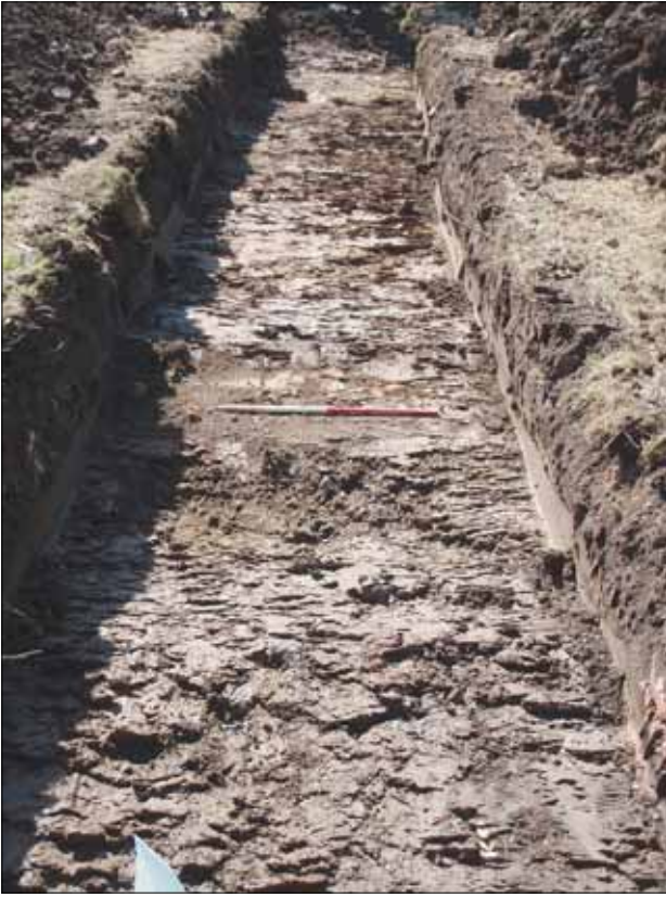
Plate 1: Trench 1, looking north