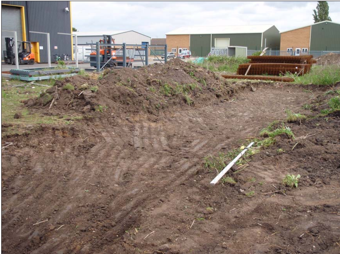
Plate 1: Working shot