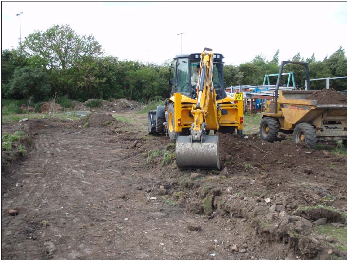
Plate 2: Working shot